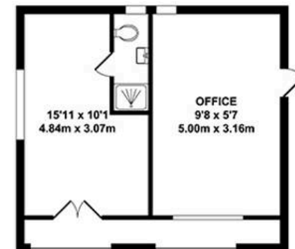
OUTBUILDING APPROX. FLOOR AREA 388 SQ.FT. (36.08 SQ.M.)