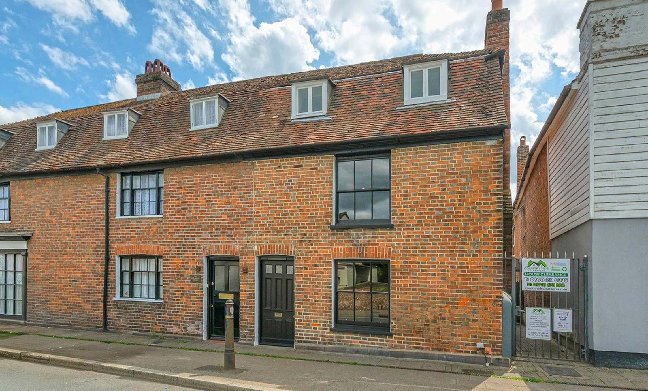
Grays House High Street, Hadlow – TN11 0EF Tonbridge