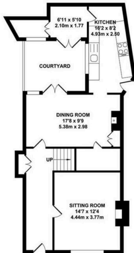
GROUND FLOOR APPROX. FLOOR AREA 826 SQ.FT. (76.73 SQ.M.)