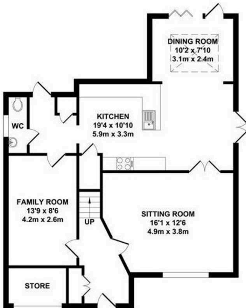
GROUND FLOOR APPROX. FLOOR AREA 794 SQ. FT. (73.81 SQ. M)