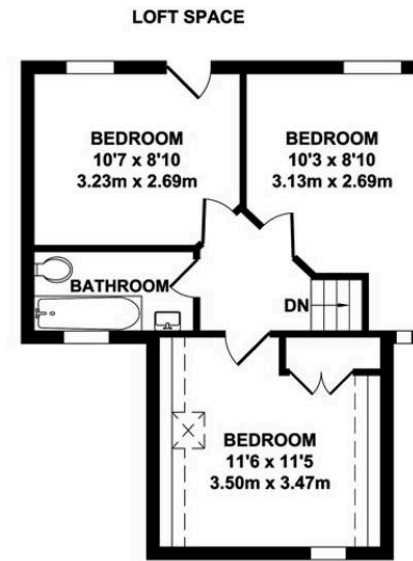
FIRST FLOOR APPROX. FLOOR AREA 388 SQ.FT. (36.02 SQ.M.)