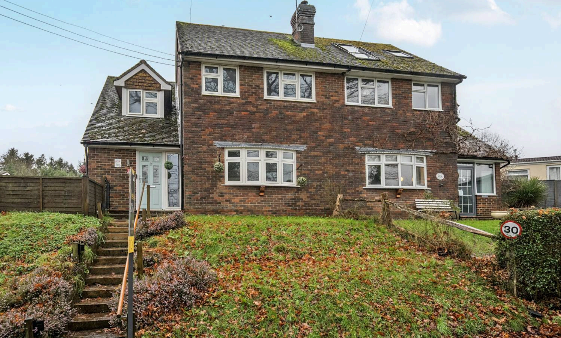
Rose Cottage Chafford Lane, Fordcombe – TN3 0SP Tunbridge Wells

Guide Price £500,000 bracketts est. 1828