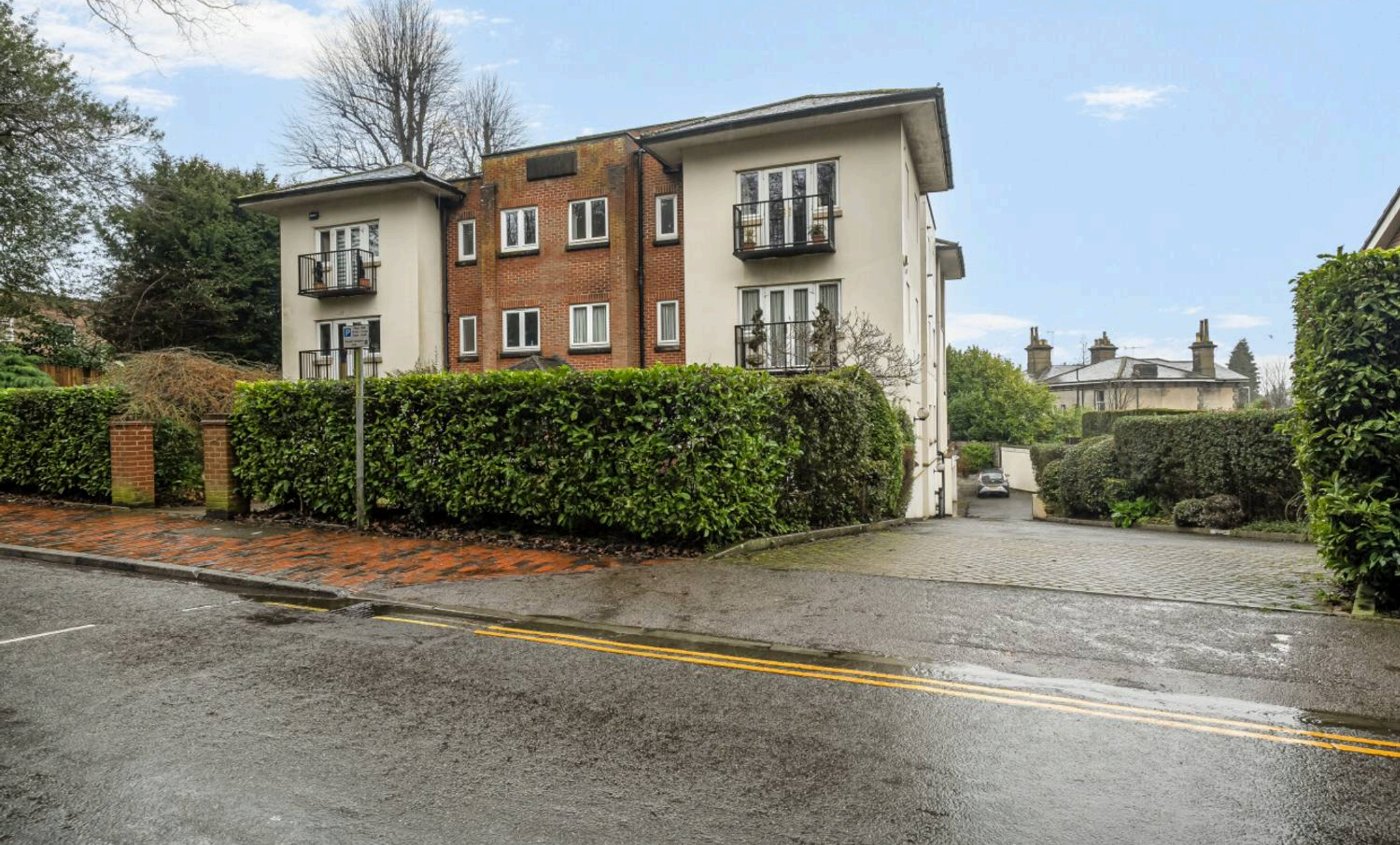
Carlton House, 10 Carlton Road – TN1 2JS Tunbridge Wells