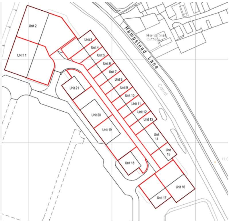
Layouts for identification purposes only