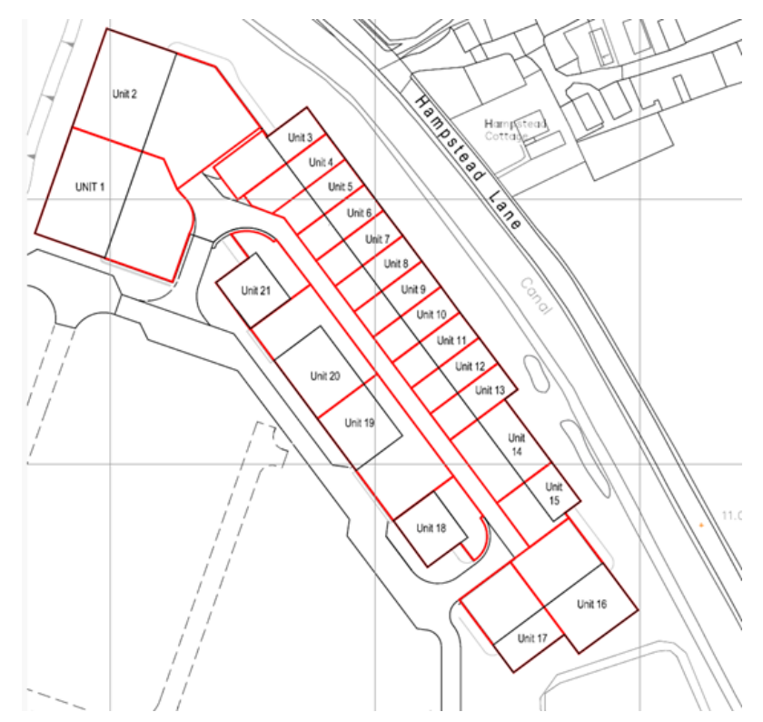
Layouts for identification purposes only