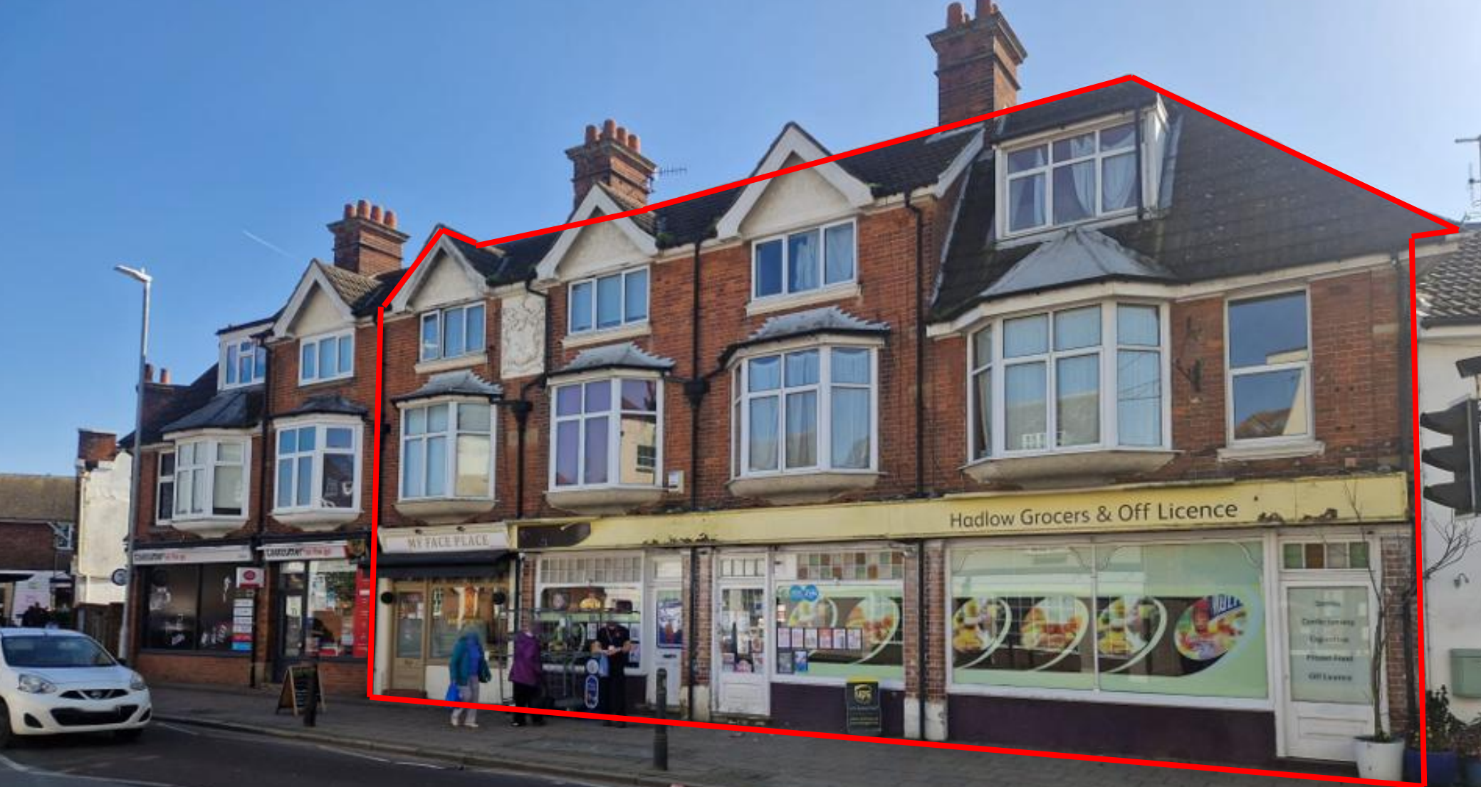
INDICATIVE RED LINE FOR IDENTIFICATION PURPOSES ONLY