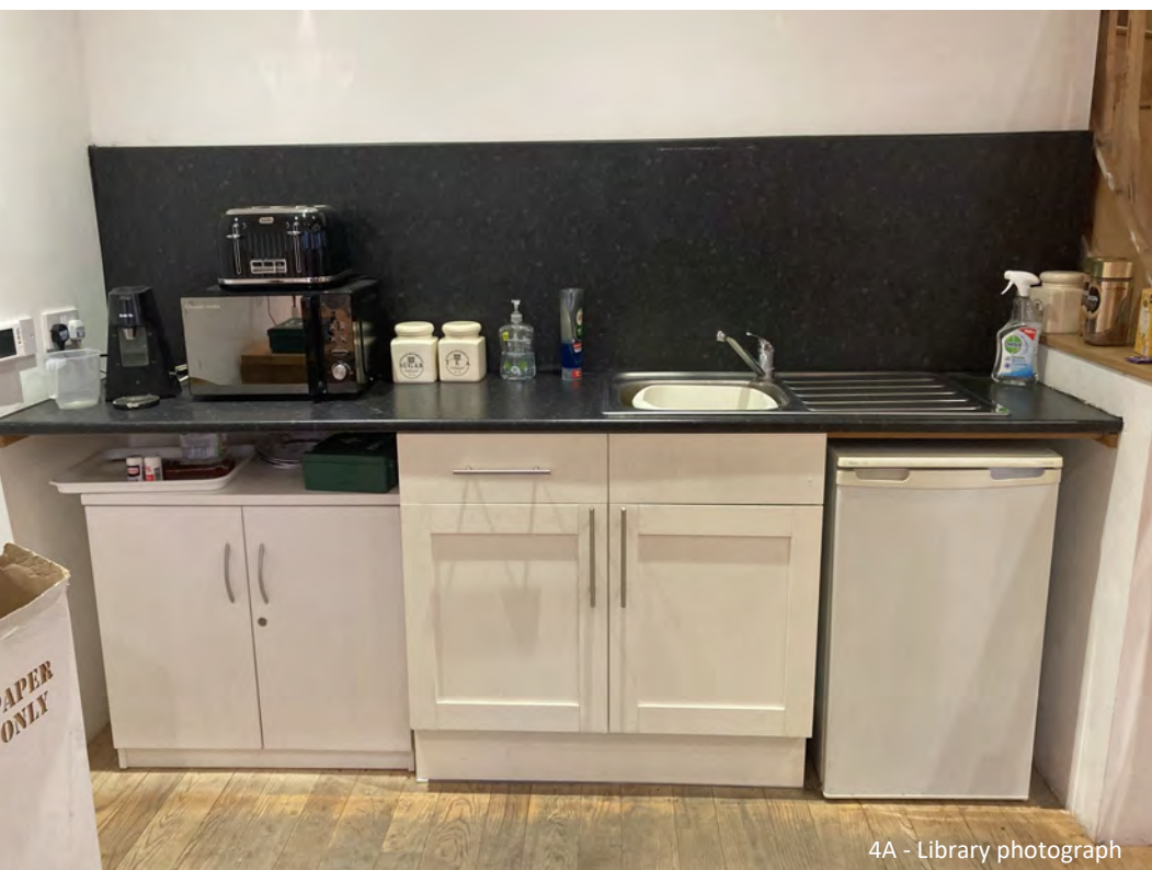
4A - Library photograph