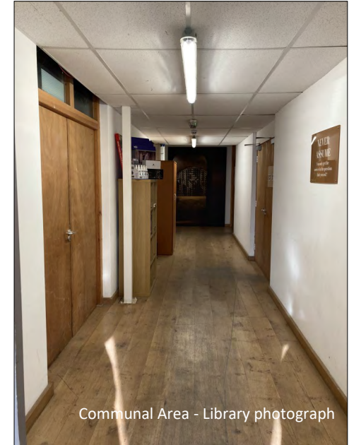
Communal Area - Library photograph