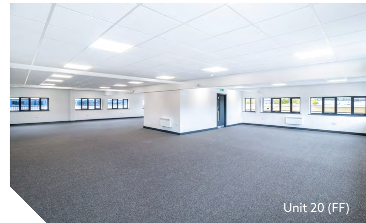
Unit 20 (FF)

GIA APPROX. 7,590 SQ FT [705 SQ M] WITH YARD