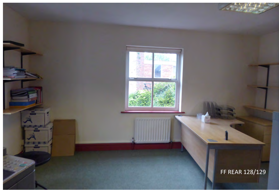
FF REAR 128/129